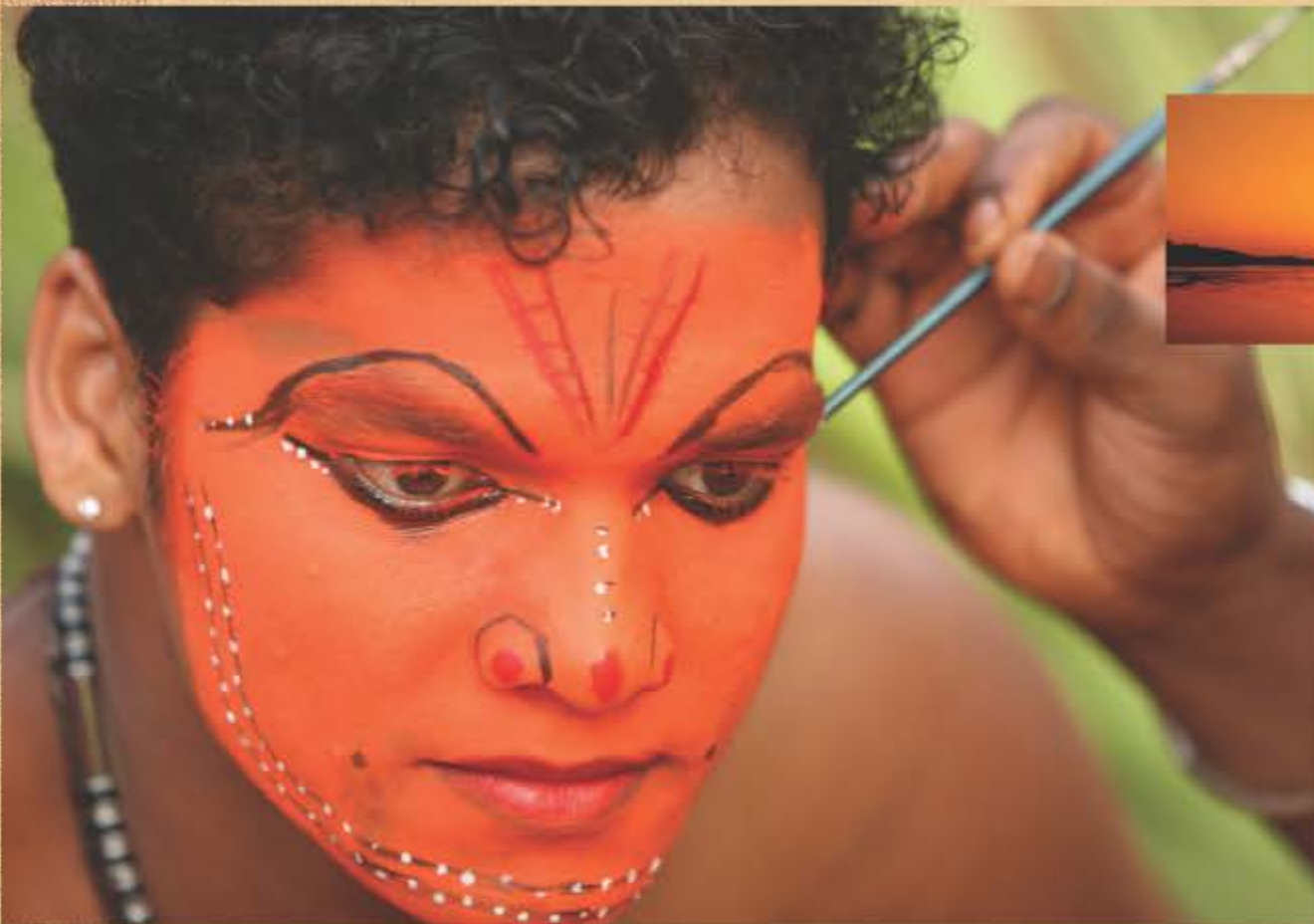
● Experiential Holidays ● Customised Tour Packages ● Conference & Incentive Packages ● Ayurveda Packages