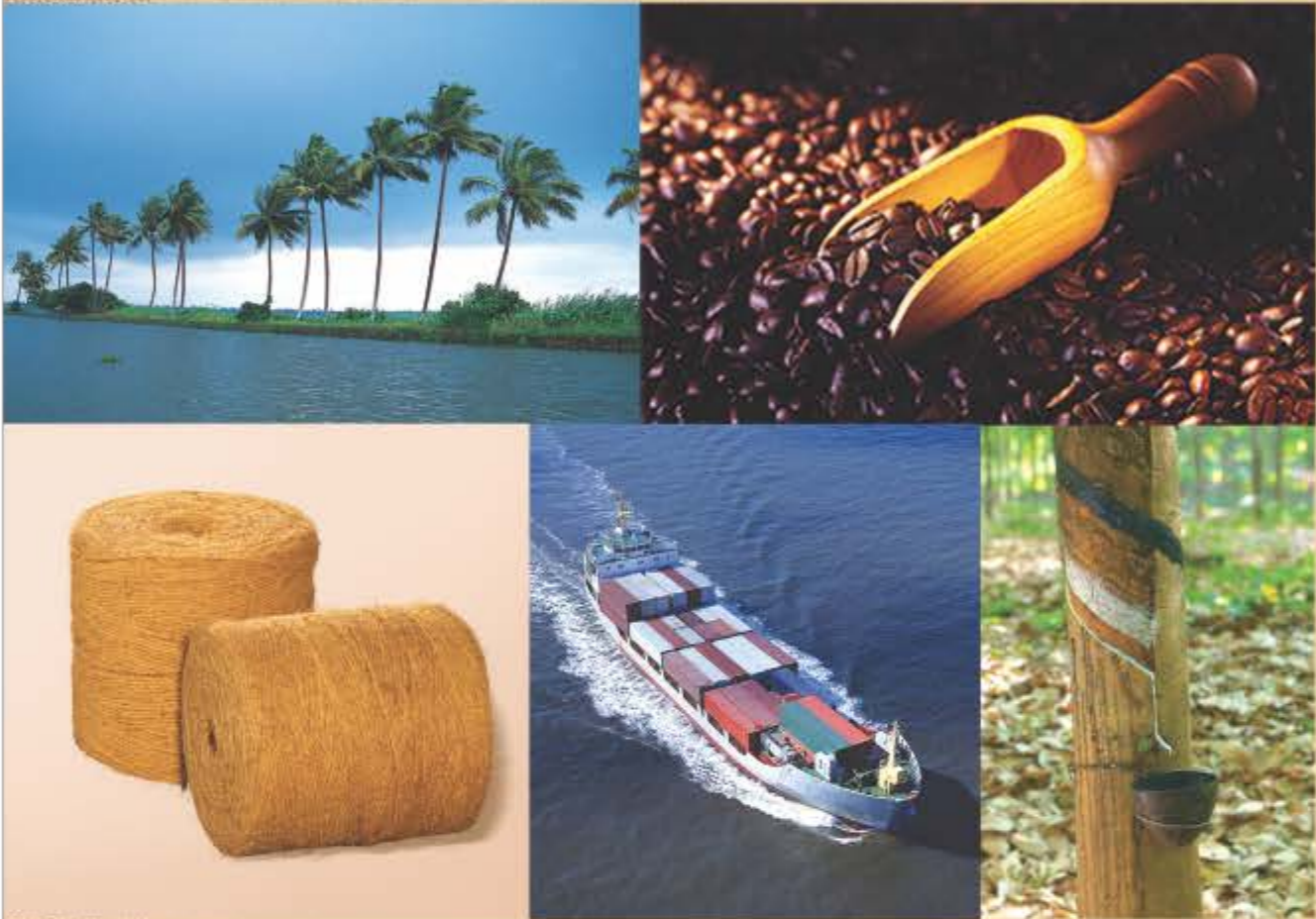
● Logistics ● Coffee ● Coir ● Plantation ● Tourism