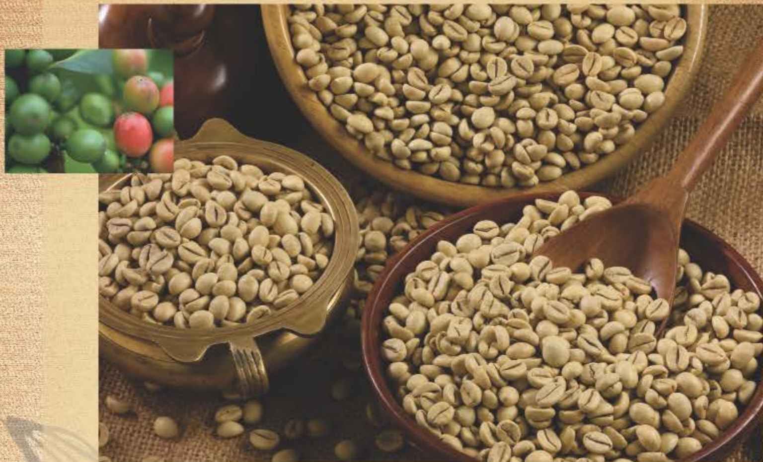
Monsooned Coffee: Monsooned Malabar AA • Monsooned Robusta AA • Monsooned Basanally Green Coffee: Plantation Grades • Arabica Cherry Grades • Robusta Cherry Grades • Robusta Parchments Grades

One of the finest produces of naturally rich southern India has been Coffee, and Aspinwall Group realised this in good time. A coffee division was thereby established in the port city of Mangalore. The city shortly transformed itself into a two-way channel for ensuring supplies to the plantations across Coorg, Chikmagalur and Hassan and exporting finished produce of Monsooned & Green Coffee beans from Mangalore. The pioneering Monsooned Coffee processed and exported by the division brought in matchless laurels to the company and has since been the most sought after flavour.