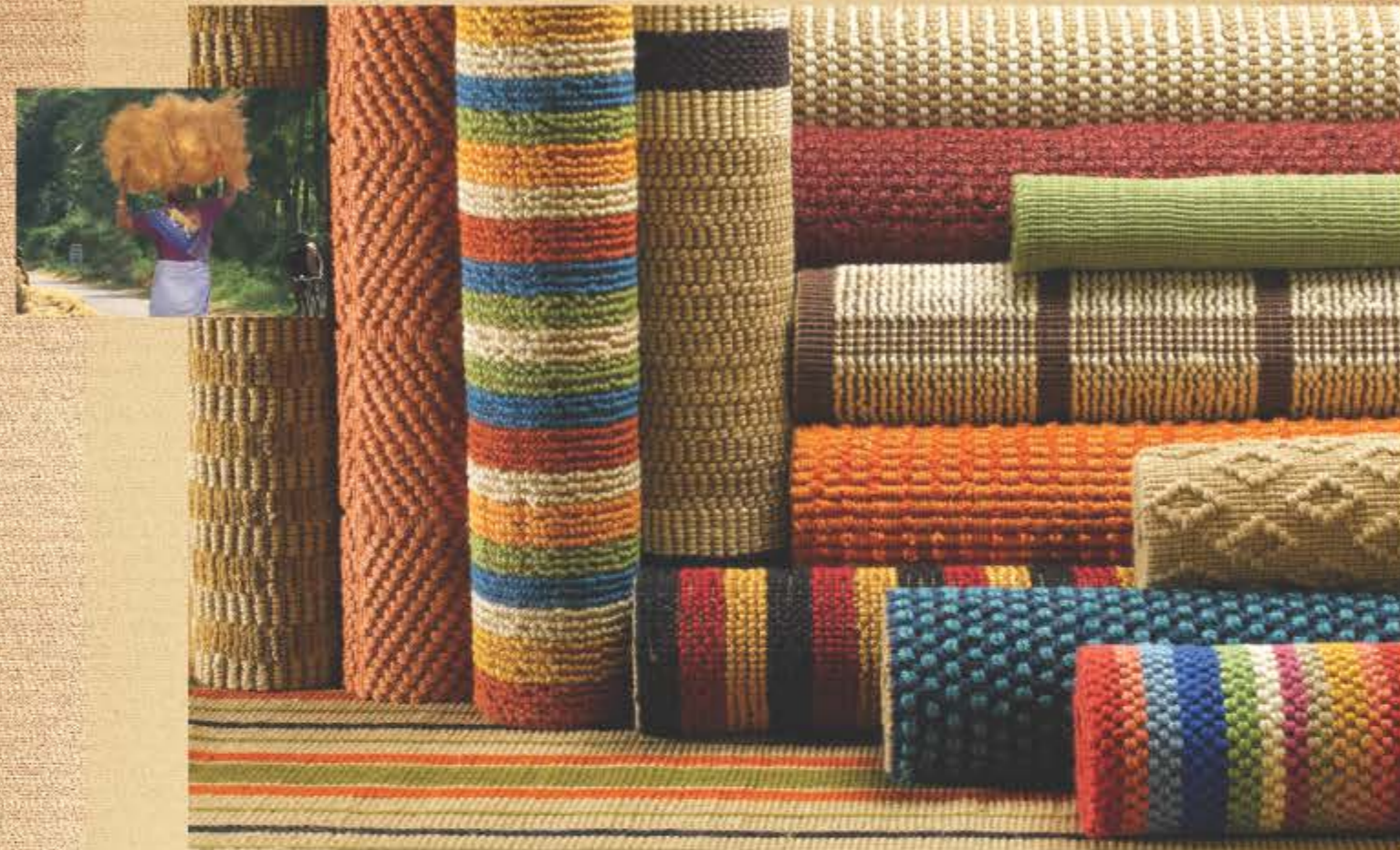
• Coir Furnishings • Jute Furnishings • Eco-friendly Floor Coverings

Coir, a 100% natural fibre extracted from the husk of coconuts, is plentiful in Kerala. In-fact, Kerala derived its name from 'Kera' meaning coconut. On seeing the great potential in coir manufacture, Aspinwall set up factories in the small town of Alleppey. Products ranging from entrance mats, carpets, rugs, runners to rubber backed coir products, jute floor coverings, furnishings and some fine eco-friendly products started rolling out from these factories.