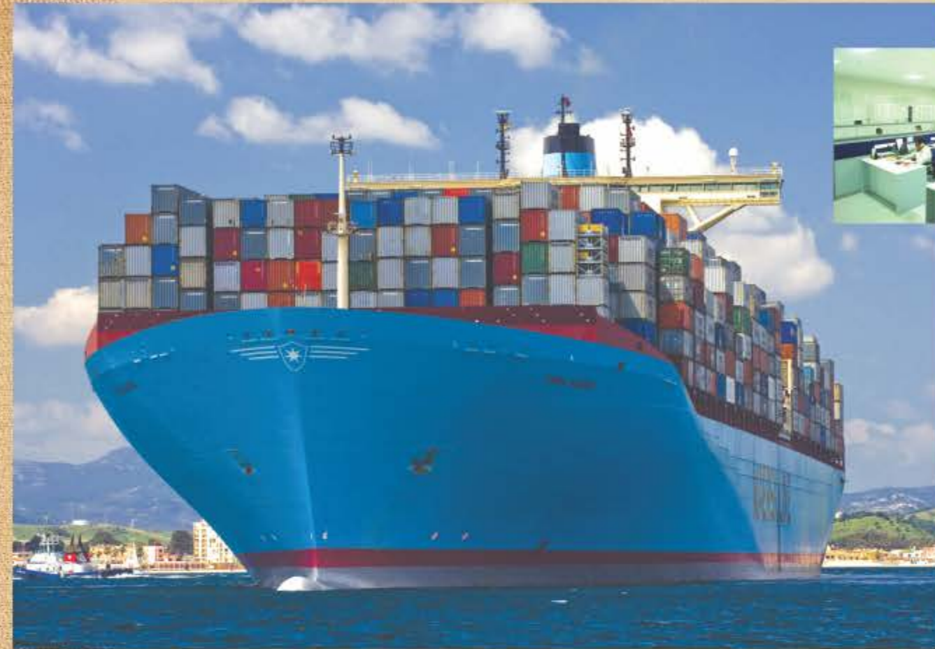
● Ship Services ● Liner Services ● Custom House Agents ● Stevedoring Services ● Bulk Cargo Handling ● Air Cargo ● Freight Forwarding Services ● Warehouse Services ● Project Cargo & ODC Handling

The picturesque hills of North Kerala had immense potential for rubber extraction. With the beginning of the twentieth century, Aspinwall instituted Rubber plantation in the area and thus brought to life, one of the first rubber estates in Kerala's organized plantation sector. Owning and managing 2000 acres of rubber plantations was not easy, but the company went on to produce high-grade centrifuged latex and technically specified natural rubber in due course from its estates at Malappuram.