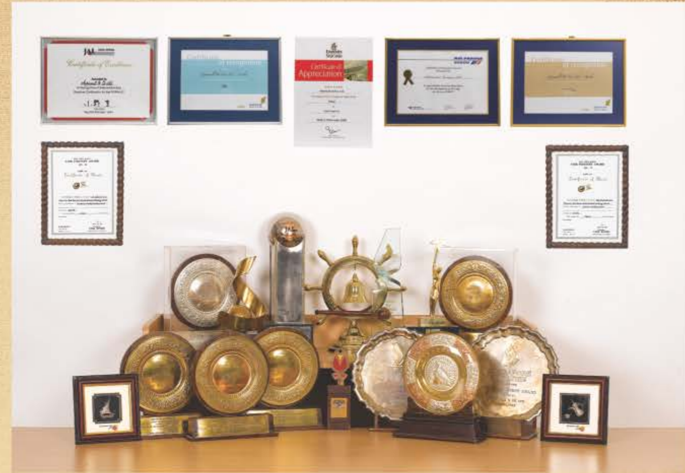
● Certifications ● Awards