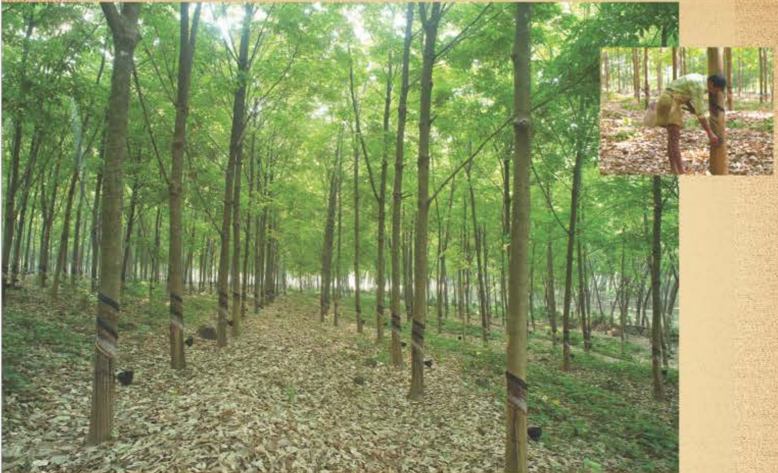
● High-Grade Centrifuged Latex ● Technically specified natural rubber